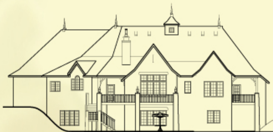
E3 REAR ELEVATION