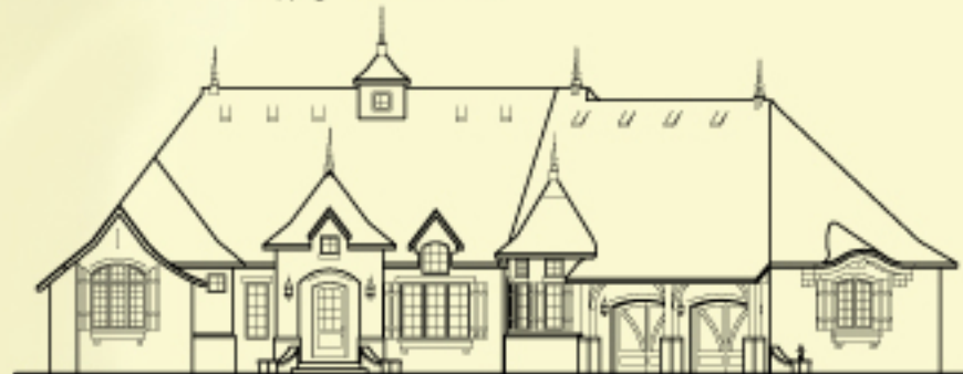
E1 FRONT ELEVATION