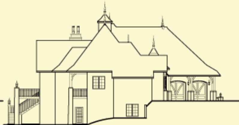
E2 LEFT ELEVATION