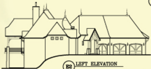
E2 LEFT ELEVATION