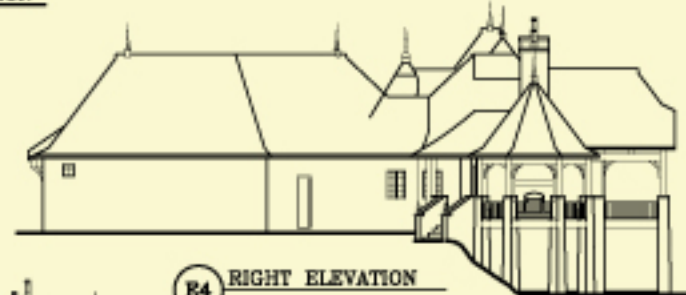
E4 RIGHT ELEVATION