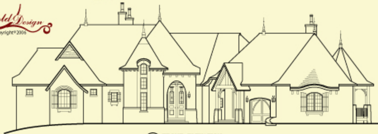
E1 FRONT ELEVATION